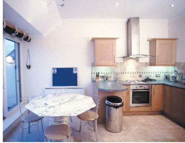
Open plan cooking, al fresco dining

Designed to the highest specifications, the Penthouse is private, yet just 500 yards from the heart of Mevagissey – a five-minute walk to the shops, restaurants, pubs, museums and harbour.